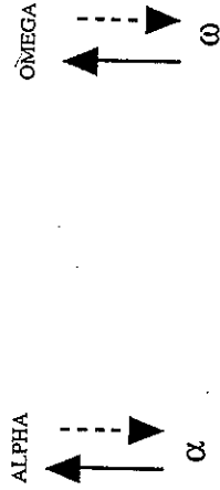
Figure 1. Empiricist (up arrow) and relativist (down arrow) interpretations of culture-metaculture relations.

One interpretation is empiricist: The metacultural characterization of the object is ALPHA (or OMEGA) because the object really is an \alpha (or \omega ), that is, because it really is sufficiently similar to (or different from) its predecessors to warrant being called ALPHA (or OMEGA). The qualities of perceptible cultural objects determine metacultural characterizations of them. The world of cultural things discloses itself directly to metacultural understanding, finds its way into or is reflected in that understanding.